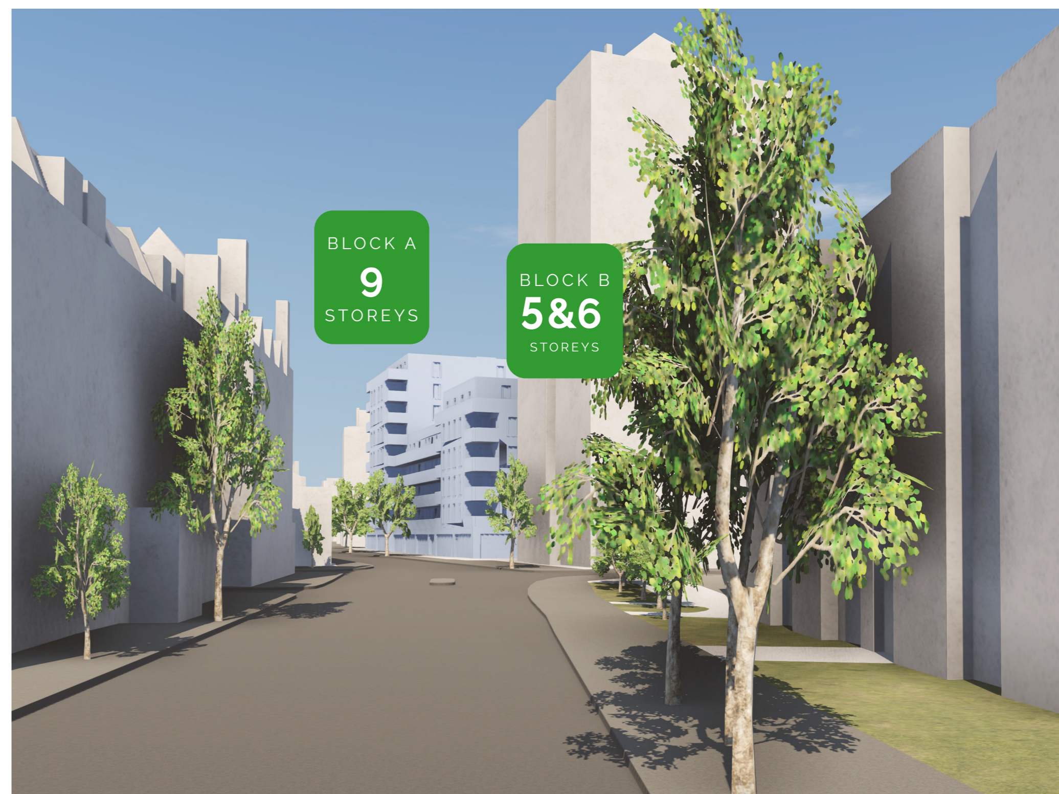
Proposed massing as viewed from Roman Road, West.