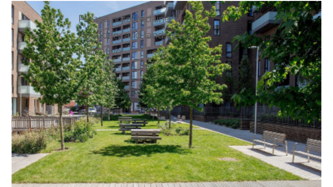
Photo Credits: Aberfeldy London Borough of Tower Hamlets: Levitt Bernstein An open landscape structure with good sightlines and spaces for socialising

Landscape proposals and plan below produced by Staton Cohen Landscape Architecture.